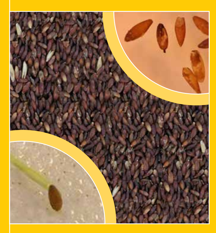
Join the discussion FAQ's on Website... www.miscanthusbreeding.org/faq/default.html

Our new F1 Miscanthus crosses are now ready for large scale assessment trials. We are currently looking for new growing partners to help develop the agronomy for different climates and soils.